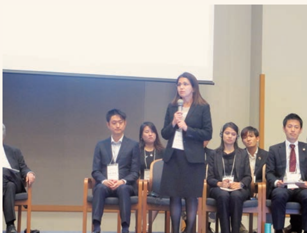
Presentation of young researchers at the roundtable discussion