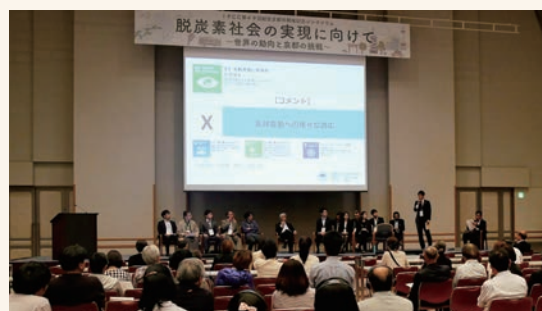
Audience of IPCC roundtable with Young Researchers