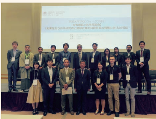
Participants of the roundtable discussion with President Yamagiwa