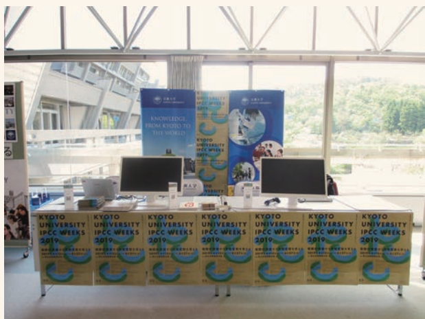
Kyoto International Conference Center Annex Hall, May 11, 2019 Booth of Kyoto University